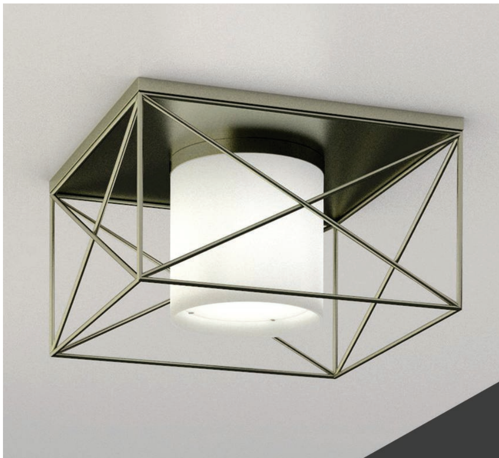
TIC TACK FIXTURE # 663.01 15" square x 9.5" drop GU24 socket for 23w CFL or LED bulb shown in Brushed Nickel finish, with seamless opal acrylic at side and bottom