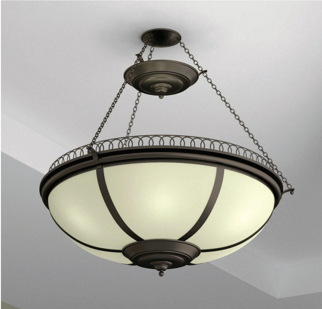
STEAKHOUSE PENDANT C-733 created for LDL Studio