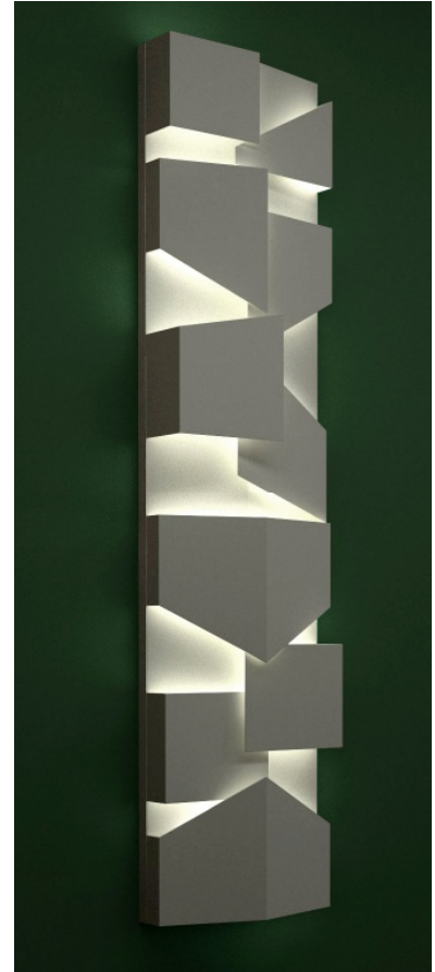
FOLDED PANELS SCONCE 48" tall x 12" wide x 4" extension, shown in Brushed Stainless and in Matte White paint, 28w. 120-277v non-dimming driver, 3000K with UL or ETL certification